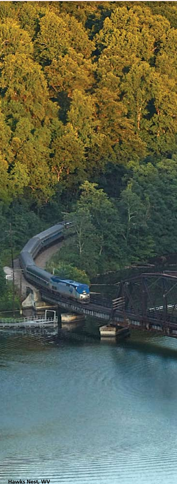
Hawks Nest, WV

Welcome aboard the Cardinal . From the flash of Broadway, the monuments of the nation's capital to the City of Big Shoulders, the Cardinal takes you through historic towns, scenic landscapes and unparalleled natural wonders on its fabulous journey south and west through America's mid-Atlantic, southeast and heartland.