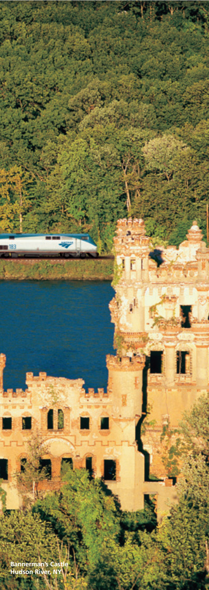
Bannerman's Castle Hudson River, NY

Welcome aboard the Vermont or Ethan Allen Express . From the flash of Broadway, the monuments of the nation's capital to the scenic vistas, snow-capped mountains and glistening valleys of New England, the Vermont and the Ethan Allen Express take you through historic towns, stunning landscapes and gorgeous natural wonders on two fabulous journeys through America's mid-Atlantic and New England regions.